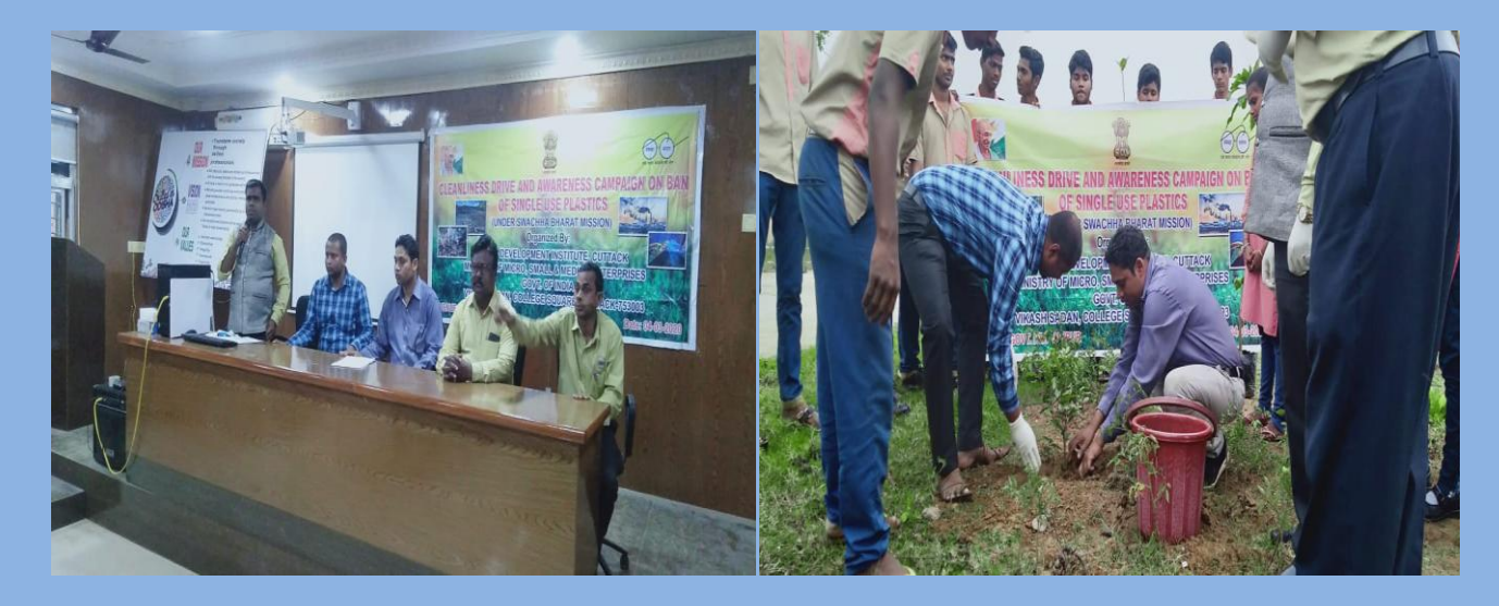
MSME-DI, Cuttack organized one day cleanliness drive and seminar on ban of single use of plastic at Govt. ITI, Jajpur on 04.03.20. Around 55 students participated. Plantation activities were also carried out during the cleanliness campaign.